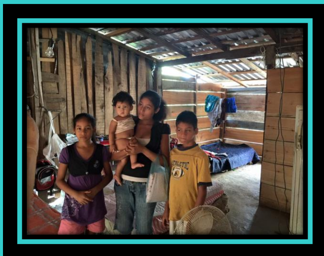
4 of the 6 children

James 1:27 “Religion that God our Father accepts is this: to look after orphans and widows in their distress and to keep oneself from being polluted by the world”. Here are a few pictures