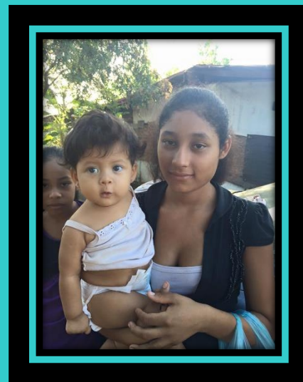
Mom 15 years and 8 month old

† These children need prayer as they progress through life without parents. The 15 year old is surrogate mom with help, goes to school four hours a day and learning to read and write. The 3 brothers do not attend school and don't know how to read and write, so pray that they will agree to do so in the future. All are receiving counselling and we pray they will be restored to mental and emotional health.