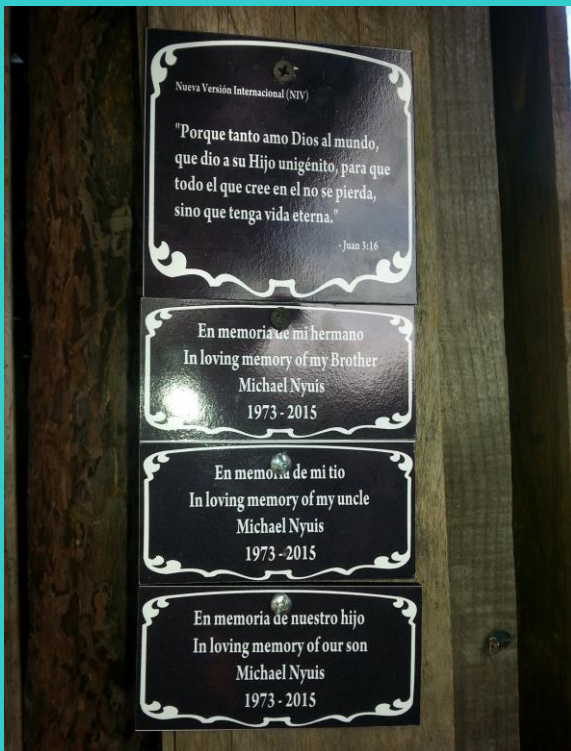
John 3:16 in Spanish